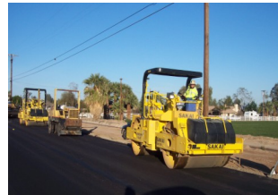
Measure D Funds in Use to Repair Road

In order to ensure transparency and responsible use of resources, Measure D requires a